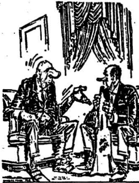
"You could ask for a popular vote on the issue and threaten to resign if it failed."